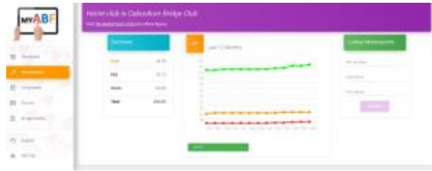
1 - Sample page view from your MyABF portal.

Read about the online portal for ABF members (page 8) called My ABF. Register to update your profile and readily access ABF information.